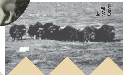
Int'l Wolf Center

Answers: A—Whitetail deer B—Moose C—Musk ox D—Beaver